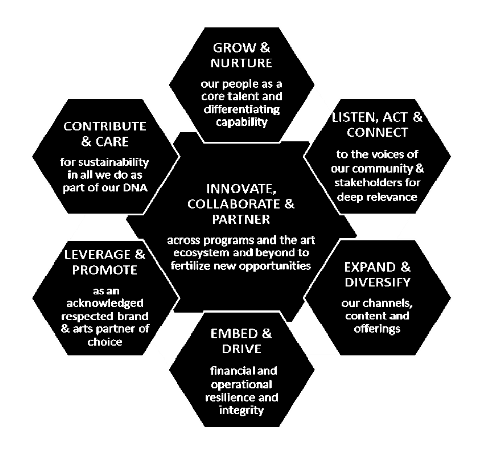
Figure 1- MfC's 7 Strategic Priorities

MfC has set 7 strategic priorities to drive our strategy. We have carefully created these priorities to focus on community and a solid business that co-delivers not just for the community, but for Canberra's ambition to be recognised as Australia's Arts Capital